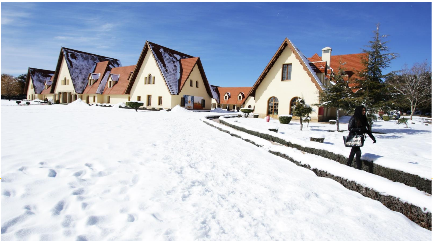
AUI's Ifrane campus in the snow