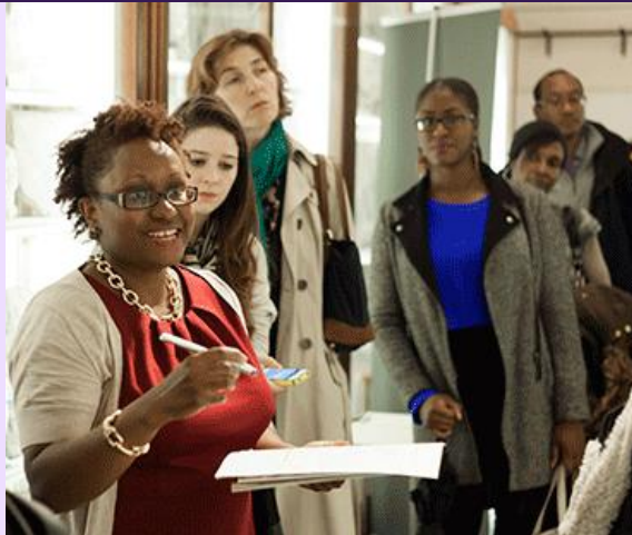
Support for Students, Staff and Managers