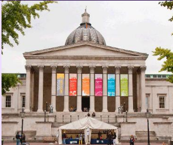
Steering groups & social networks