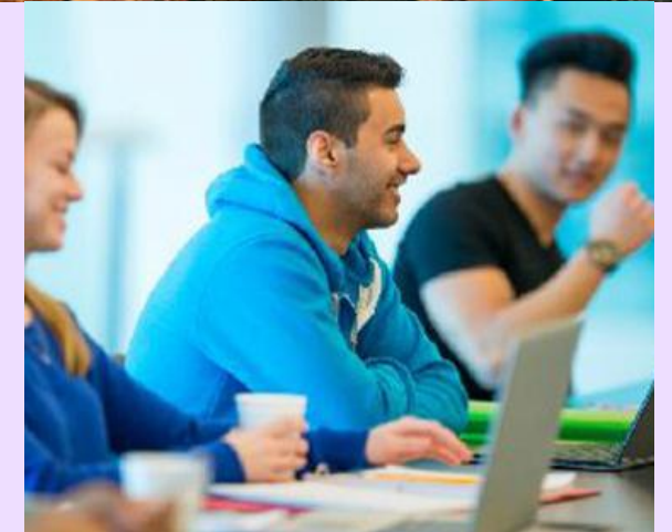
Equality, Diversity & Inclusion Training