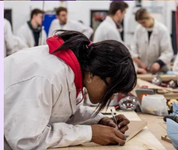
Dignity at UCL